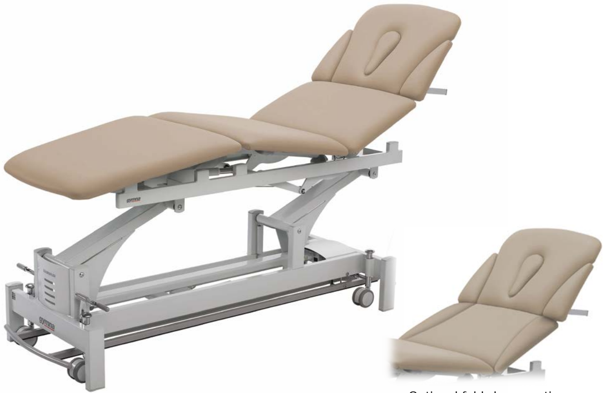
Optional fold-down sections