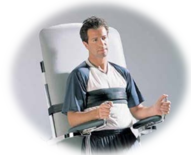
Optional arm rests